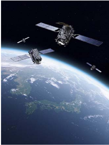
Picture 4: The Quasi-Zenith Satellite System and high precision locators, also based on Mitsubishi Electric technology, will offer centimeter-level positioning data required for safe autonomous driving.