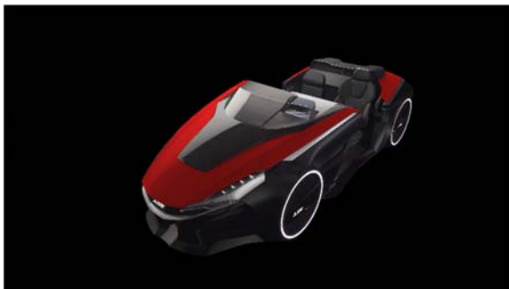
Picture 5: Mitsubishi Electric's EMIRAI xDAS 3.1, a concept car which has been designed to be the precursor of autonomous driving.